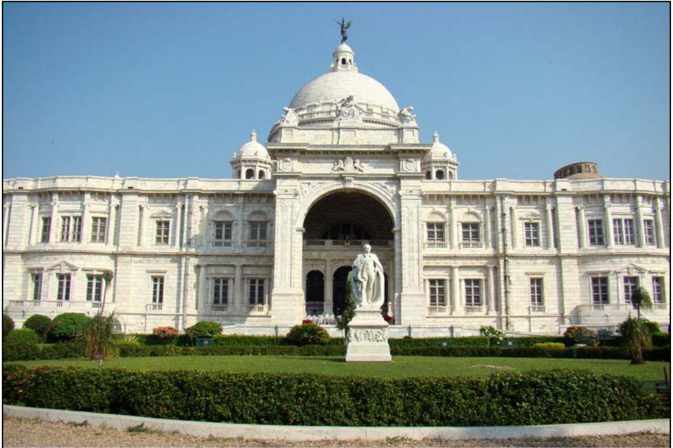
VICTORIA MEMORIAL - KOLKATA

Sati's charred body into 51 pieces that fell in different parts of the earth and a part fell on the