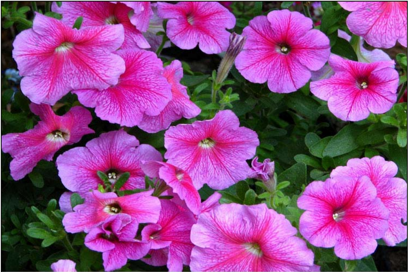
FLOWER SHOW - GANGTOK

A rare shows of exotic varieties of flowers, orchids and other plants native to Sikkim, a northeast state. Held every summer during the peak flowering season, this is a spectacular