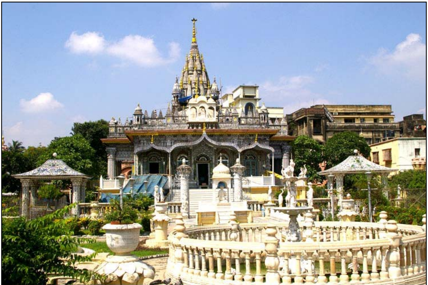
DIGAMBAR JAIN TEMPLE - KOLKATA

In the morning after breakfast visit the Famous Jain Temples of Kolkata, The Howard Bridge ,