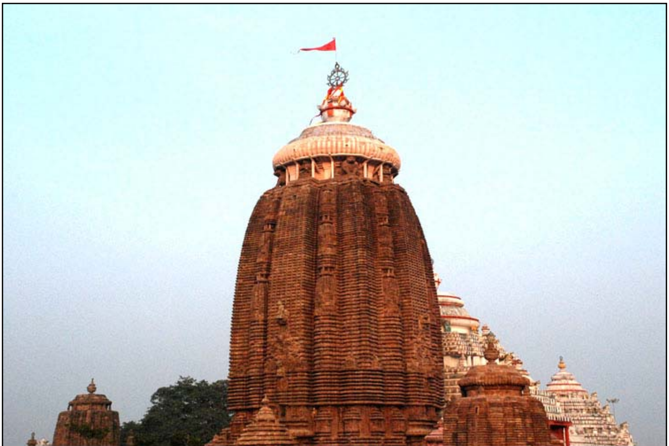
JAGANNATH TEMPLE - PURI

After breakfast visit Jagannath Temple , an attraction for the Hindus. Non-Hindus are not allowed into the temple. From the terrace of a Library opposite the temple, you can have a view of the inner temple.