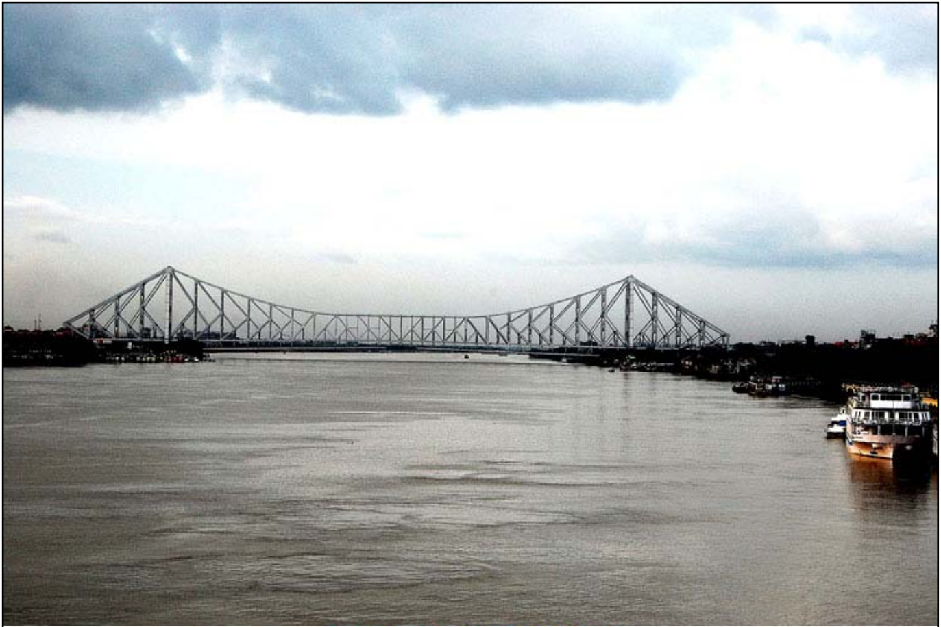
HOWRAH BRIDGE - KOLKATA

In the morning after breakfast visit the Famous Jain Temples of Kolkata, The flower Market of Kolkata, The Howard Bridge , The cantilevered bridge, also known as Rabindra Setu, is similar in size to the Sydney Harbour Bridge but carries a flow of traffic which Sydney could never dream of .It is the busiest bridge in the world. Later drive to the Kali ma temple located near