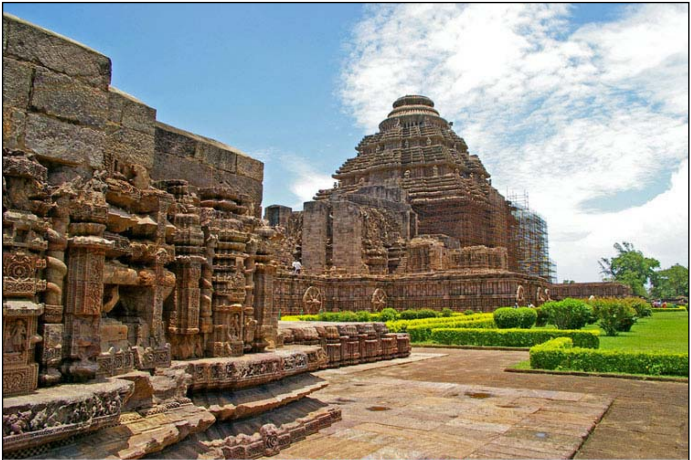
KONARK SUN TEMPLE - PURI

Enroute visit Konark, one of the most vivid architectural treasures of Hindu India and a World Heritage site. The Sun temple is the last phase of the temple architecture of the Kalinga dynasty (13 Century). Dedicated to the Sun God "Surya", the temple is in the form of a chariot. It has 12 wheels, which denote the 12 months in a year and 7 horses denote the 7 days in a week.