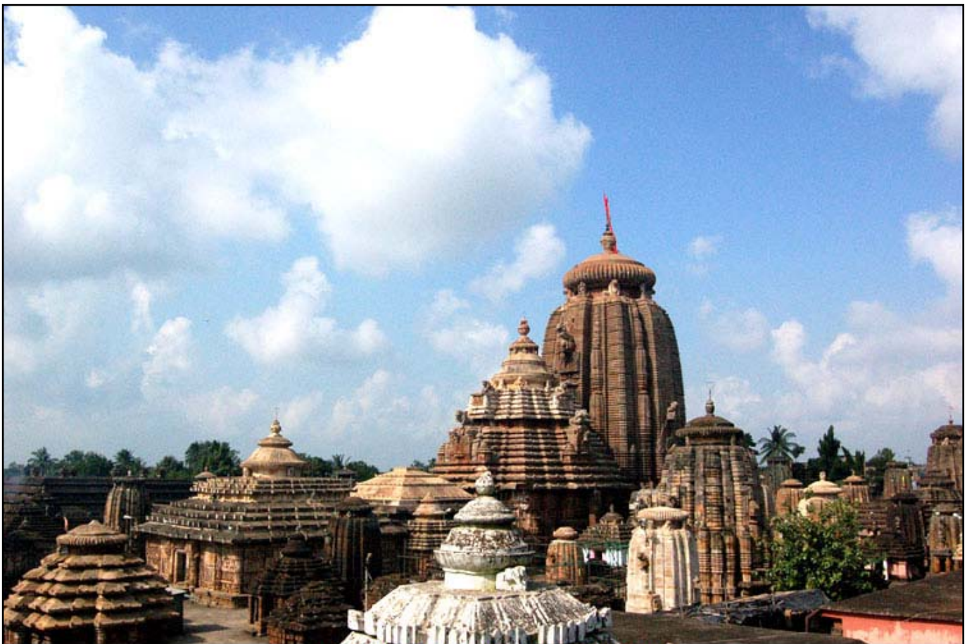
LINGARAJA TEMPLE - BHUBANESHWAR

After breakfast transfer to the Airport to board the flight to Bhubaneswar. On arrival, transfer to the Hotel and check in. Bhubaneswar, the ancient capital of the Kalinga empire , and now the capital of Orissa, its history goes back over 2000 years. "Bhubaneswar" means the "abode of God" or "master of the universe" and it was also, once known as the 'Cathedral of the East', on account of the large number of shrines. At one time, the Bindu Sagar tank was bordered by over 7000 temples. Of these, 500 still survive, all built in the extravagant Oriya style.