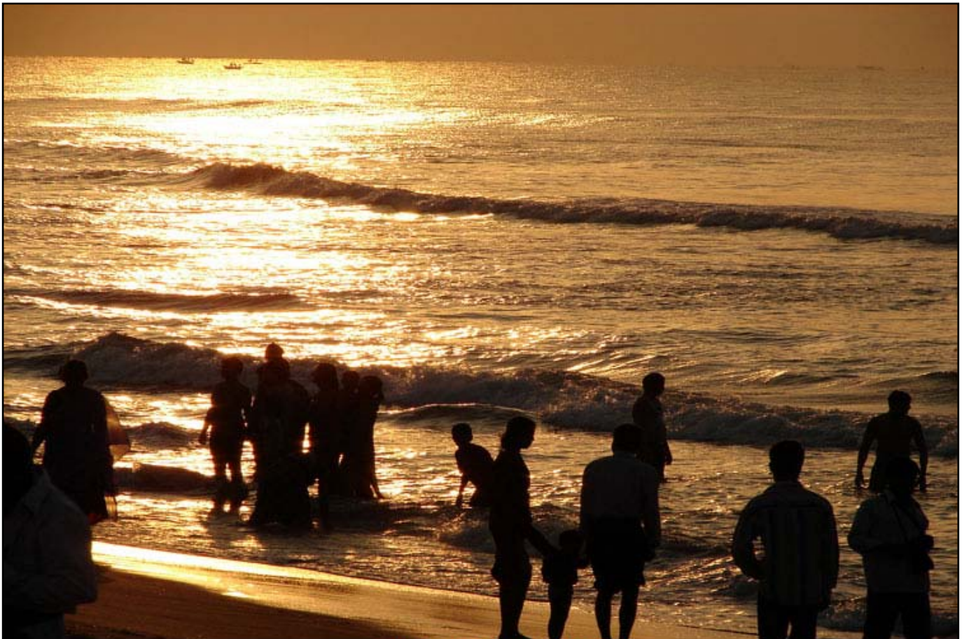
SUN RISE AT BEACH - PURI