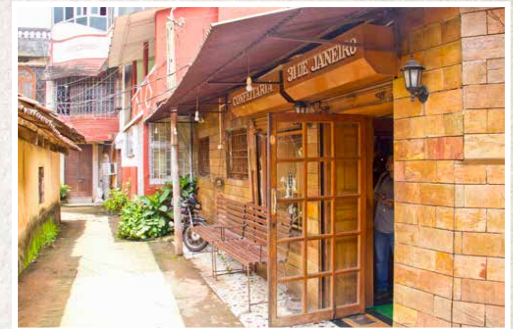
Confeitaria 31 De Janeiro_the oldest bakery in Fontainhas

Of the many wonders that the serene backwater of the Mandovi throws up, the Chorao Island is one of them. Ride onto the ferry from Ribander with your scooter on it, and get dropped on the other side. What unfolds is a spectacular sight of the reserved area of the Dr. Salim Ali Bird Sanctuary. Full of dense mangrove swamps, the most appropriate way to navigate is by a canoe. The Chorao village on the island in the middle of the river, is a small cluster of mud and thatch houses and a handful of exquisite Portuguese villas. A small village Church adds a dash of atmosphere to the already stunning place.