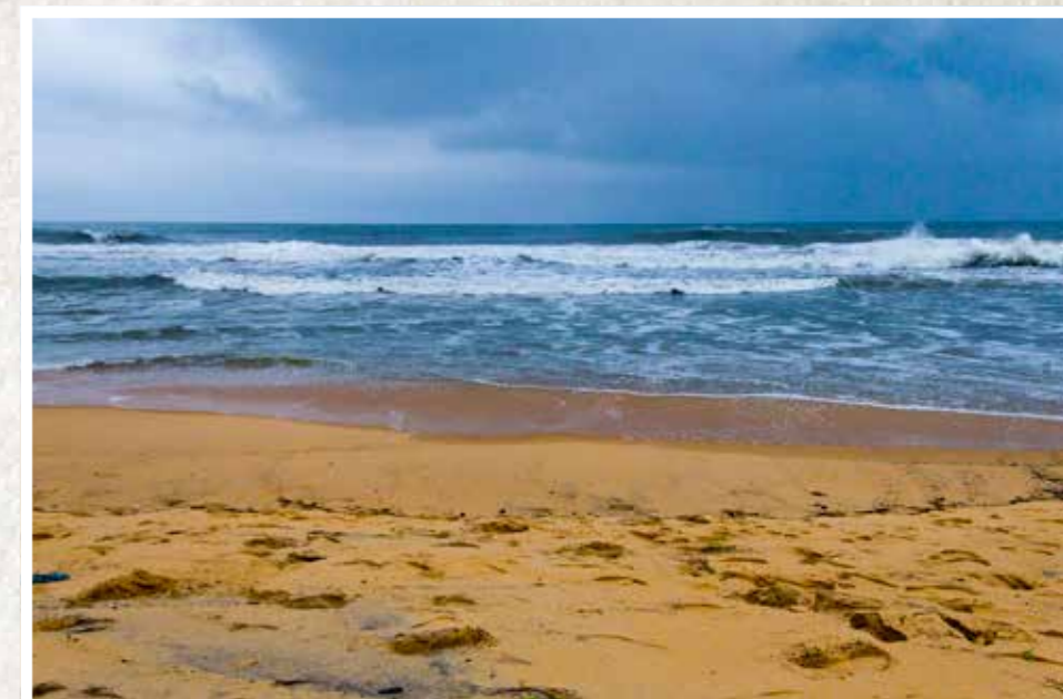
The monsoon skies drape Goa in a menacing grey

If you are a history enthusiast, a detour to Panjim's Latin Quarter, Fontainhas and the old Goa churches is recommended. Roam the slim streets of Fontainhas, shadowed by high walls, dotted with Portuguese styled windows. The red, blues and yellows give a Lisbon like