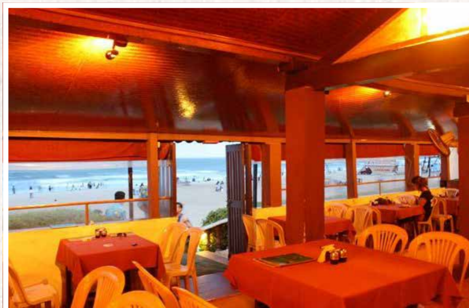
Souza Lobo on Calangute beach*.

The idea of the balmy evening sea breeze caressing her cheeks, fresh watermelon juice in hand and first row seat to a stunning sunset is the most relaxing image that Supriya can conjure up in her mind. The destination? Goa of course! No matter how many times that our in-house wanderer has hit the state, there are always new spots to discover! Goa's landscape is remarkably unique. It ranges from the dark thick-forested Western Ghats mountain range on its interior border, lush river valleys and miles of beaches skirting the Arabian Sea from its top to bottom. Add to that the charm of Portuguese inspired villas, and the lazy 'Susegad' life and you have a recipe for a holiday made for unwinding. Here are some of the top 'Goa essentials' that Supriya suggests.