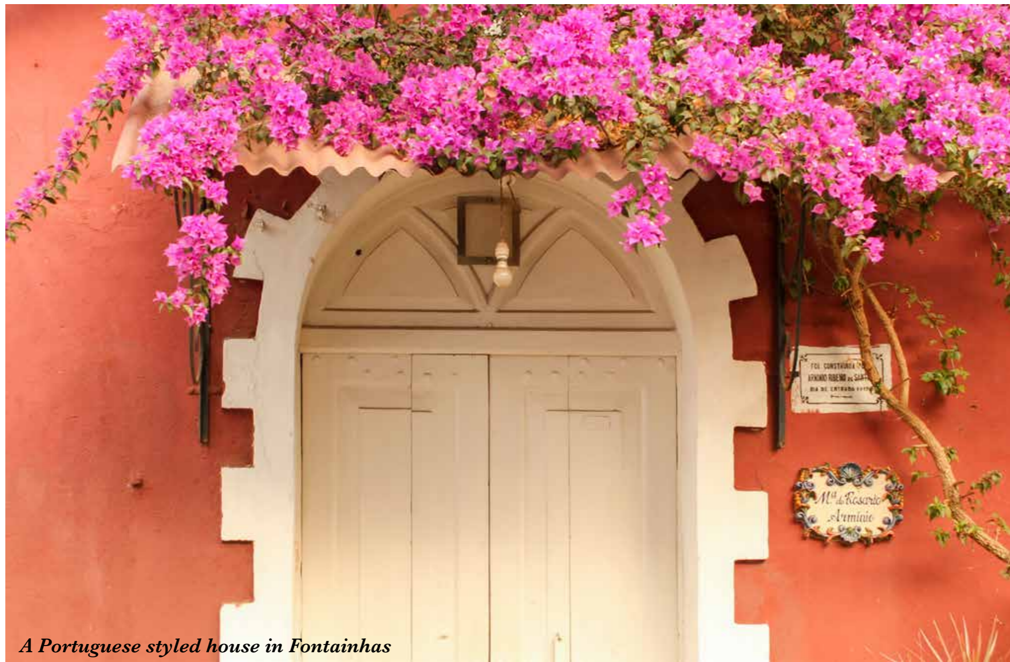
A Portuguese styled house in Fontainhas

It's time to ditch 'Goa, sand, sea and beer' in one sentence and try something like 'Goa, waterfalls, birding and history'! Let this picture appear majestically into sight and you will never go with the predictable image of Goa again. Yes, the beaches are mesmerizing and yes the warm and convivial ambience about them is hard to resist, but step into inland Goa to explore more.