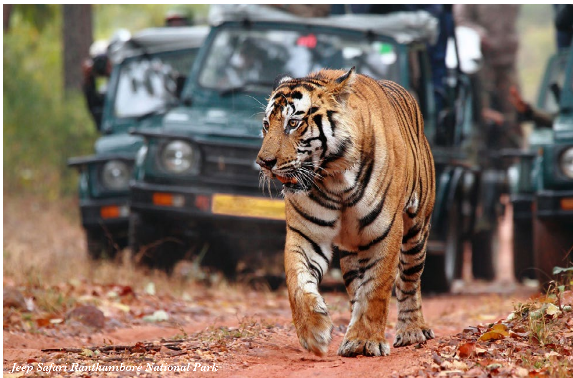
Jeep Safari Ranthambore National Park