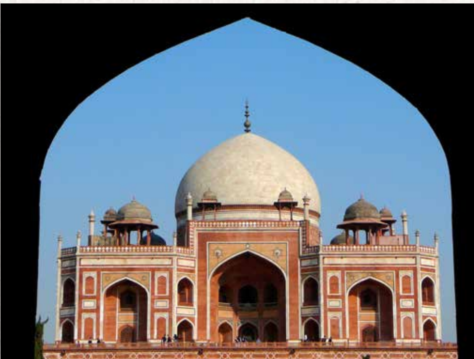
Humayun's Tomb from the entrance.

The city’s first Mughal mausoleum, Humayun’s Tomb was constructed to house the remains of the second Mughal emperor. It was built by Haji Begum, his senior widow who is buried alongside her husband. The elegant structure is reminiscent of the Taj Mahal in Agra,