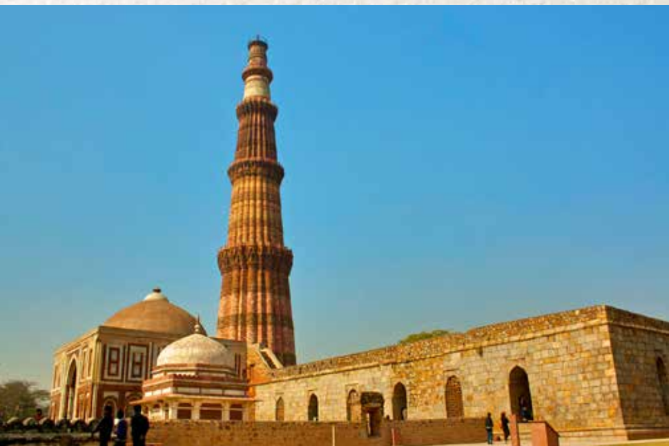
The tallest brick minarety in the world.

A slice of history with superlative statistics, the Qutab Minar promises to enthrall. This is the tallest brick minarety in the world, and the second tallest tower in India. The tall structure and the sprawl of ruins around make for an atmospheric trip for a couple of hours. The 13th century monument lies juxtaposed with the cosmopolitan vibe of the city. A few hours are ample to take in the anecdotes about its construction.