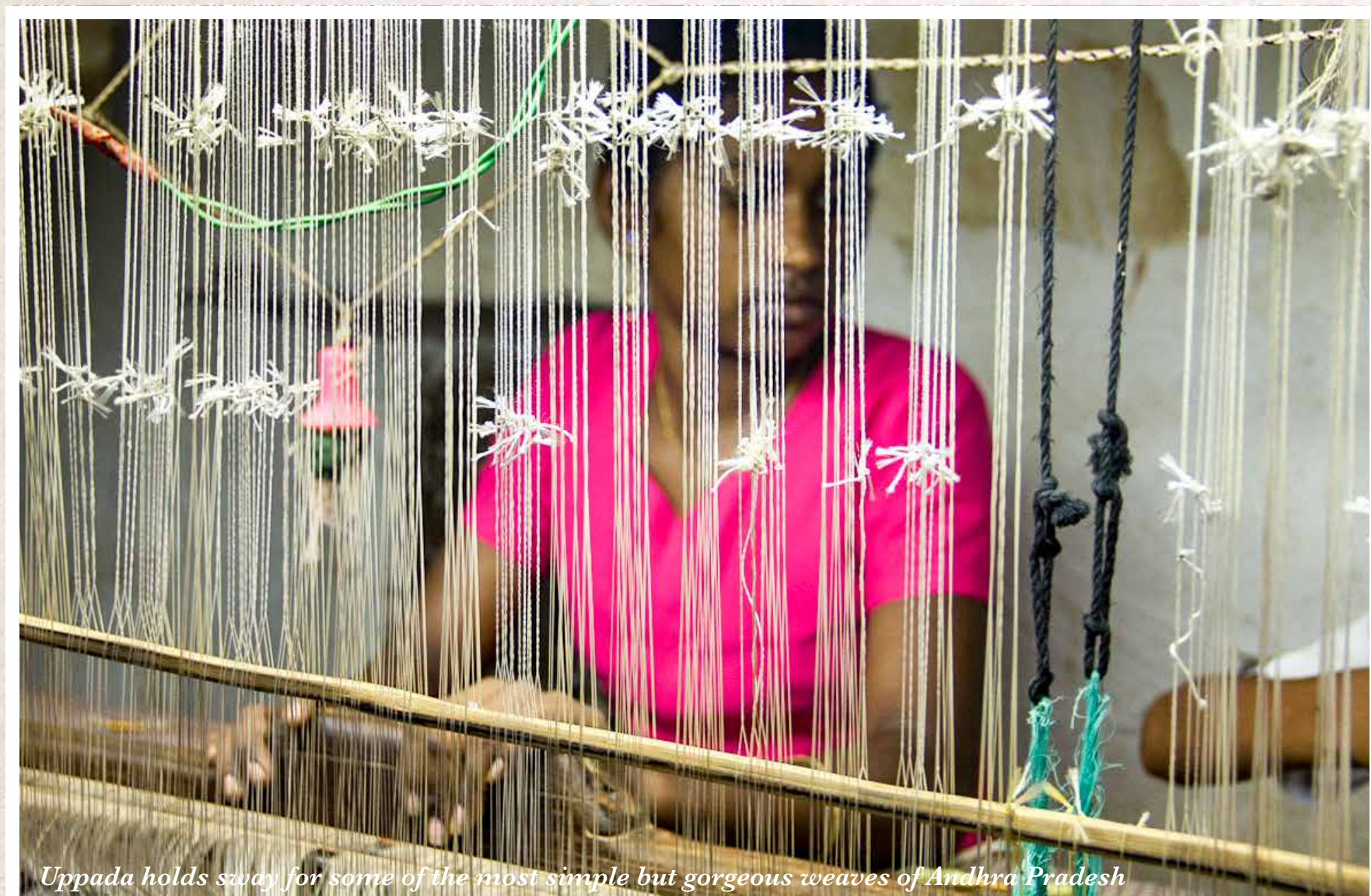
Uppada holds sway for some of the most simple but gorgeous weaves of Andhra Pradesh