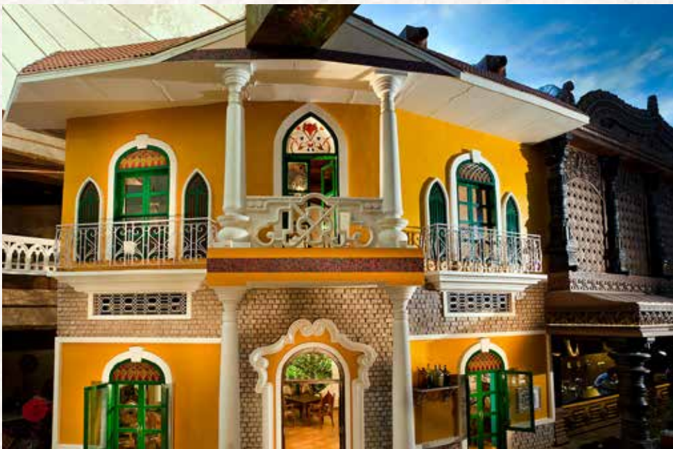
Goa Pavillion at the Kingdom of Dreams

the only difference being, that this is constructed in red sandstone and inlaid with black and white marble. The manicured lawns of the structure are a great place to sunbathe in the wintery chill and take in the effect of the stunning architectural skill.